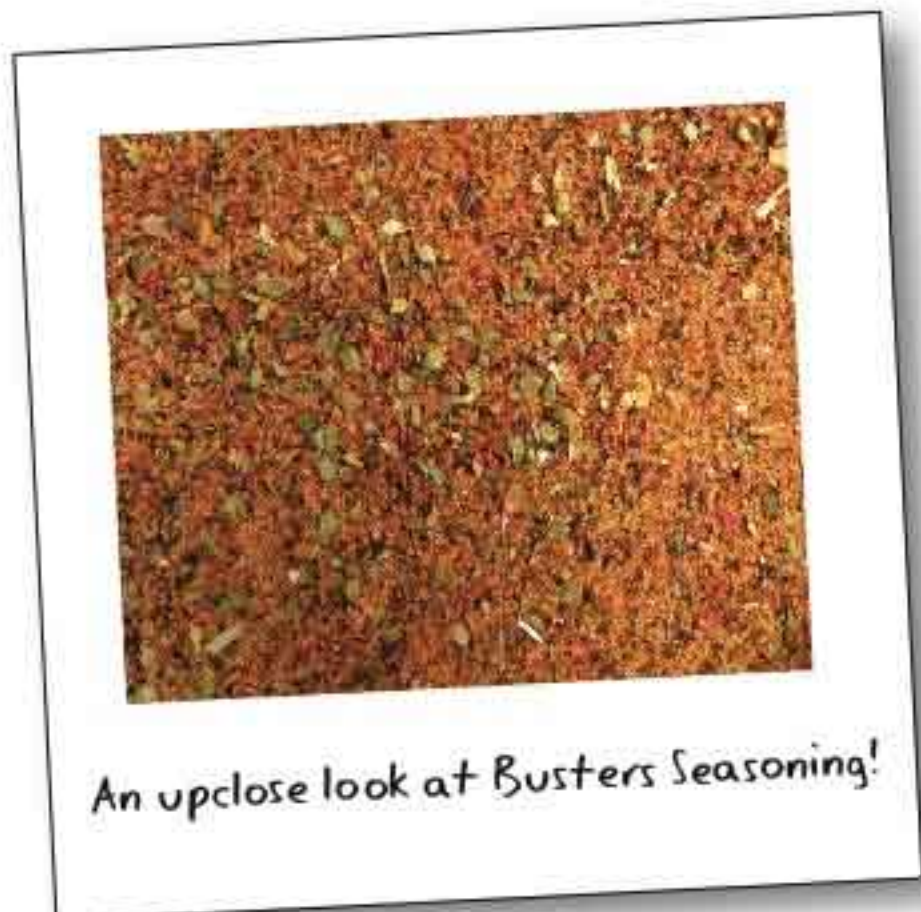
An upclose look at Busters Seasoning!

CAUTION – This product will create an insatiable desire for second helpings!